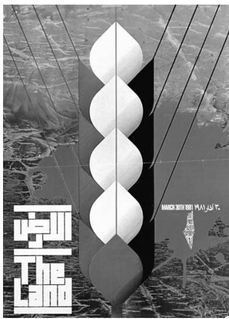
1981 Palestinian political poster marking Land Day

tors of one nation, one struggle, and one cause, and the liberation of Palestine means - must mean - justice, liberation and self-determination for the entire Palestinian nation, in all of its constituent sectors. Just as Zionism has waged war on the Palestinian people, it has attempted - and continues to attempt - to divide these sectors of the people from one another, place their interests at odds to one another, and promise concessions to one at the expense of another. In order to forward its goals, it has attempted to create an "Israeli Arab" identity that is separate from both the Palestinian people as a whole, and from the Arab people in their entirety. The "Israeli Arab" identity is one that is "Israeli" first, and only then Arab - even then, Arab identity is confined to a cultural or linguistic construct, without national rights, community identification, political meaning, or self-determination. However, the Zionist drive to redefine, narrow and debilitate Arab Palestinian identity has been, despite 59 years of occupation, deeply unsuccessful. And it is in this lack of success that the persecution of Bishara, Kana'aneh, Saleh and the Palestinian Arab movement is rooted.