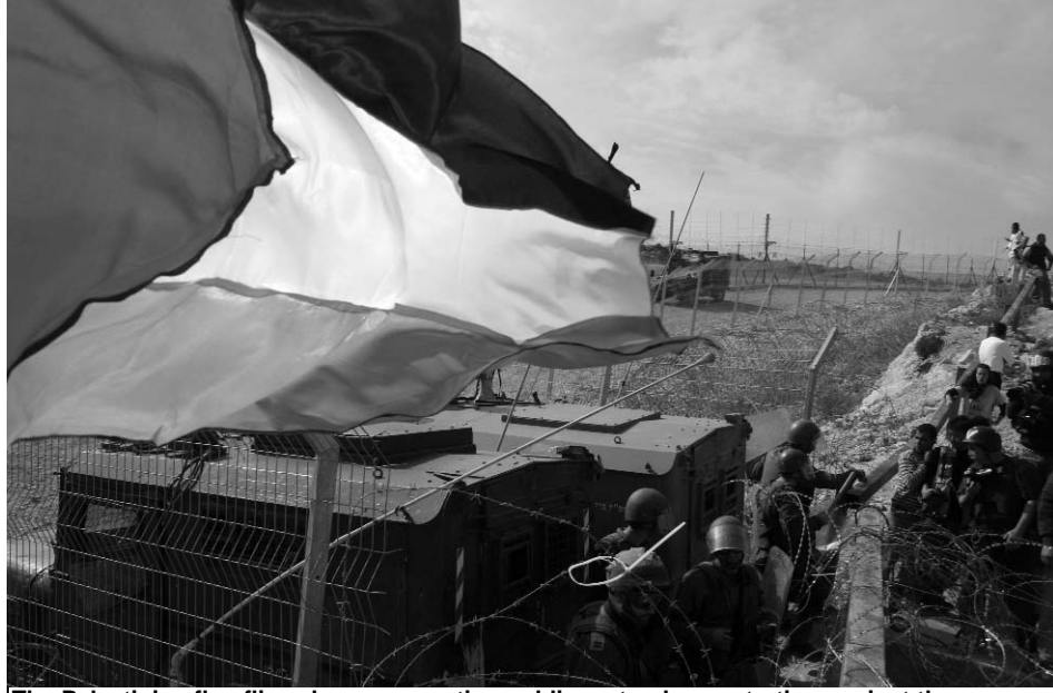
The Palestinian flag flies above occupation soldiers at a demonstration against the Apartheid Wall in the Palestinian village of Bil'in.

More than 30 years later, we will again be out on the streets and in the fields confronting the Occupation. Over 20 protests and demonstrations will unite the people in villages and cities across the West Bank in a week of continuous mobilization, while Palestinians on the other side of the Green Line will hold protests against the ongoing racism and colonization of their lands. But is the world willing to see our protests and the reality on the ground?